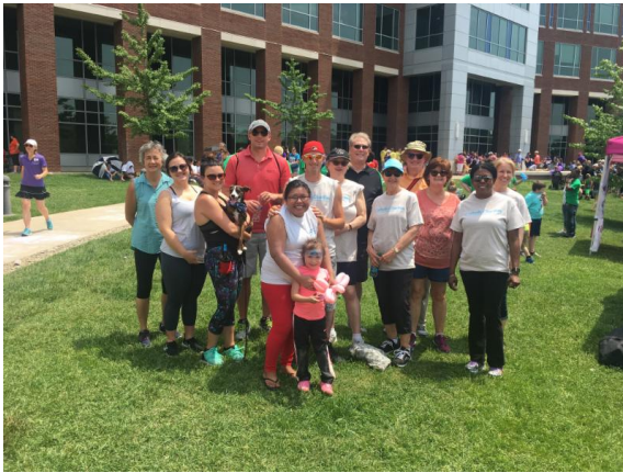
Some of this year's walking team supporting the efforts of Catholic Charities Indianapolis.

Catholic Charities Indianapolis participates annually in the Walking for Dreams event hosted by the Dodson Group. This year's event was held on Sunday, May 20. This is an opportunity for Catholic Charities to fundraise and friendraise while encouraging healthy living. Funds from this year's event were targeted to support the Catholic Charities Indianapolis programs of St.